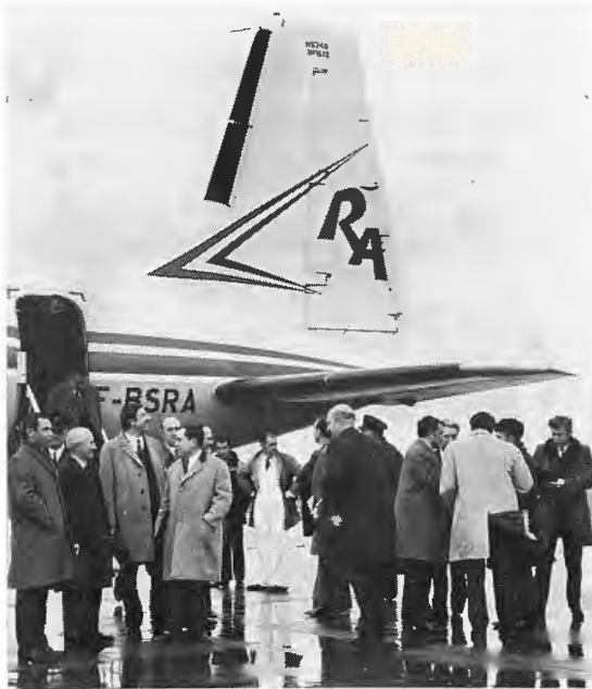
Touch down at Hawarden for our visitors.