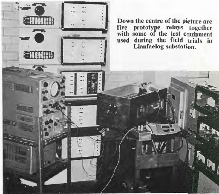
Down the centre of the picture are five prototype relays together with some of the test equipment used during the field trials in Llanfaelog substation.

During the following twelve months, staff from Rhostyllen and Anglesey District co-operated with the special site tests which had been devised to evaluate the performance